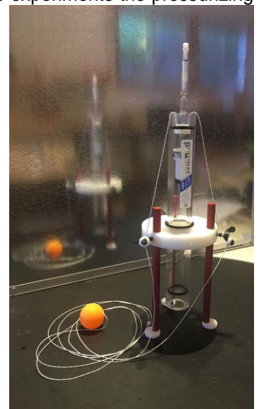
Fig. 5, completed standard setup. Note the cords tied to the screws

Should you have any comments about this or any of our other products, be they good or bad, we would greatly appreciate hearing from you!