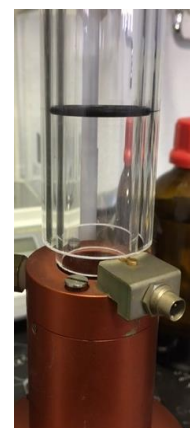
Fig. 1, Non-integrated optic Sensor

In the case of the older Varian systems without any sample changer upper barrel additional hardware the protection tube can even be placed even lower so it covers the input to the upper barrel completely, see Fig. 2.