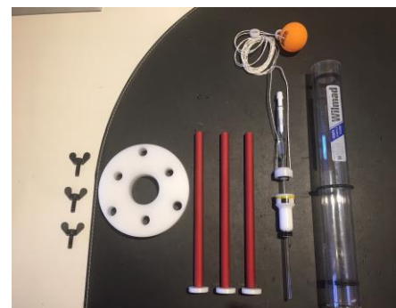
Fig. 3, Parts from left to right: Screws, white support ring, rods, pressure tube inserted in tube holder and spinner turbine, tube assembly.

The spinner turbines for Bruker NMR Instruments are a nigh on perfect fit inside the inner tube so you can use the explosion protection chamber as a double walled device. In the case of Oxford Instruments there are no spinner turbines so the tube can be supported by the supplied tube holder