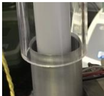
Fig. 2, Varian / Agilent system adjustment

Initial adjustment: If your laboratory only has one NMR system or only one is to be used for high pressure NMR set the explosion protection chamber up such that the legs are in contact with the top of the magnet and the bottom of the protection chamber just touches the top of the upper barrel protruding from the magnet. A pneumatic seal is not required so a slight gap of 0.5mm or less is acceptable.